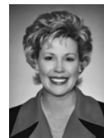
by Mary Gerdt

It appears to be a race to the finish line to see how quickly major hotel brands can establish their own gift card program. Marriott was the first hotel company with a gift card program last year. As you race down the pre-paid track you will want to do so with great caution or you may just wind up in last place.